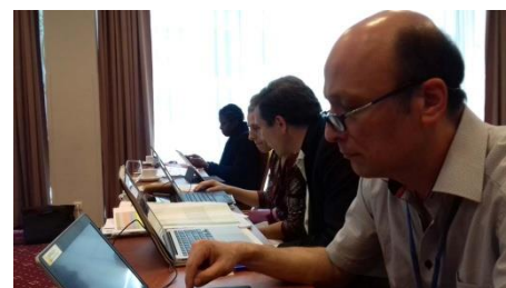
Panel of lecturers of Day 3 (SITEX-II pilot training session in Kaunas)