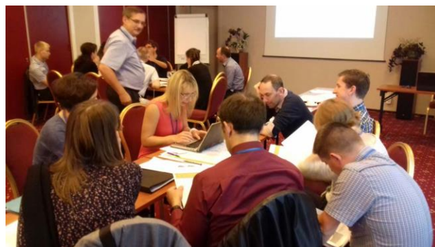
Working in groups (practical exercises)