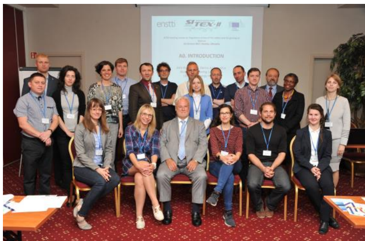
Participants of SITEX pilot training session in Kaunas, Lithuania (12-16 June 2017)