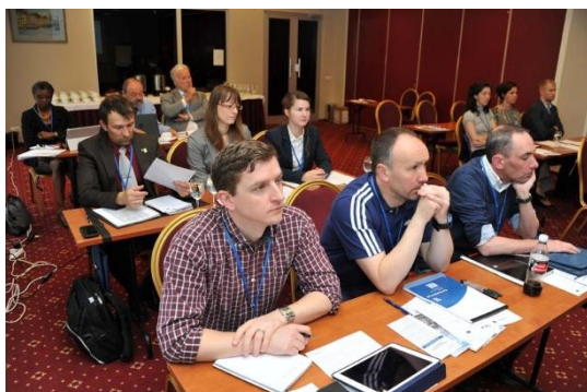
Participants at lectures