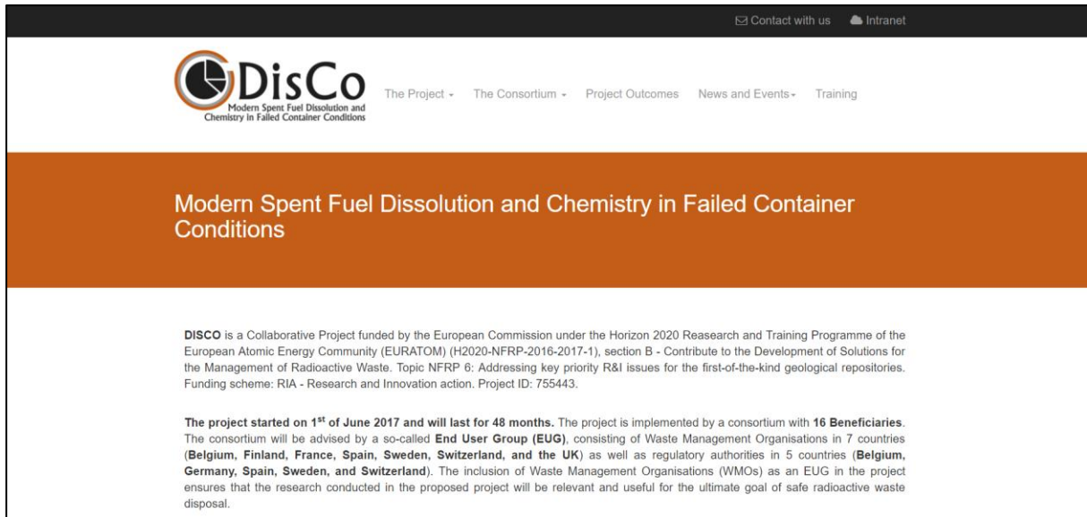
Figure 1. Screenshot of the DisCo homepage.

The project webpage has been set up and it is accessible to project participants since July 2017 at the following address: https://www.disco-h2020.eu/ . A screenshot of the home page is shown in Figure 1.